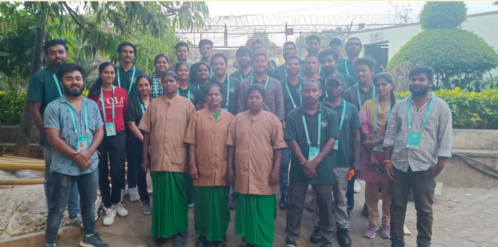
Team Saahas Zero Waste at Chinnaswamy Stadium, Bengaluru