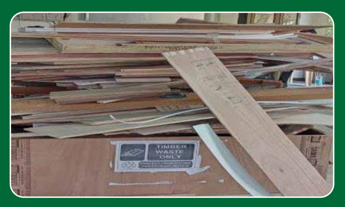
Wood Storage Area