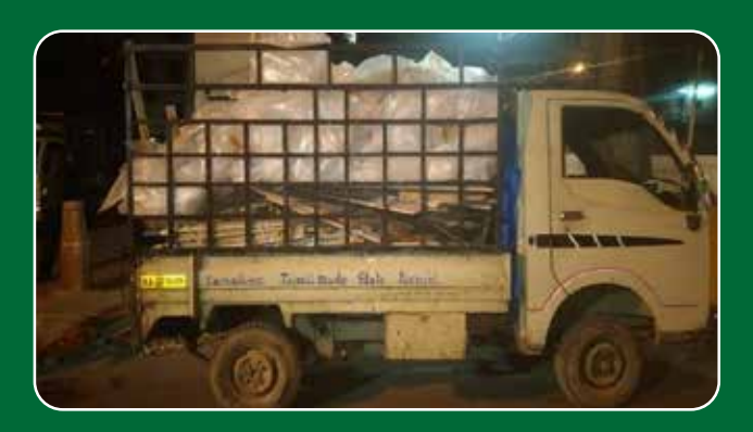
Dry Waste managed at Saahas Zero Waste MRF

Collaborated with authorized recyclers such as Sobha Limited Concrete Products Division, JK Cement, and others for processing and co-processing.