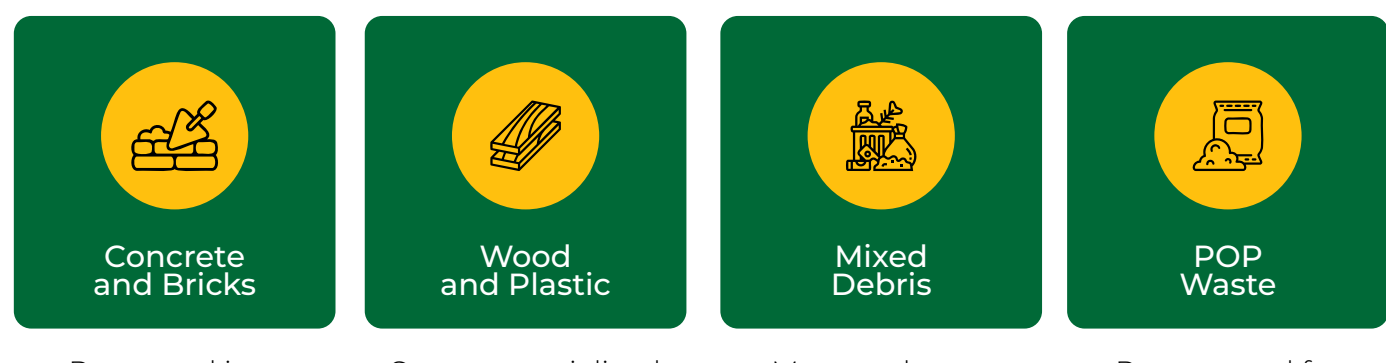
Processed into recycled aggregates

Waste was meticulously categorized onsite into major streams